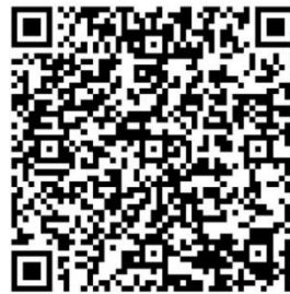
walkie-talkie tool (Android)